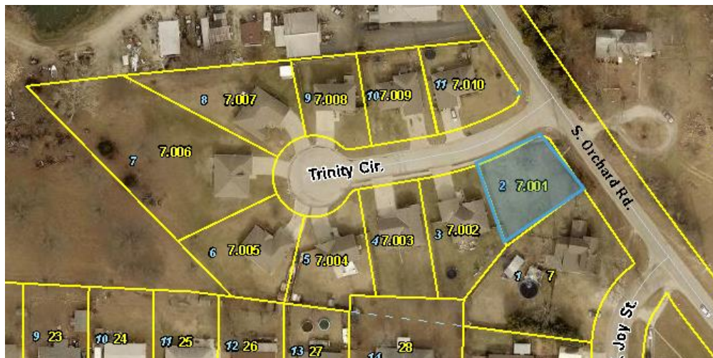
109 Trinity Circle – Vicinity Map

Attachment: Staff Report - J Southard 109 Trinity Circle rear setback (John Southard Staff Report)